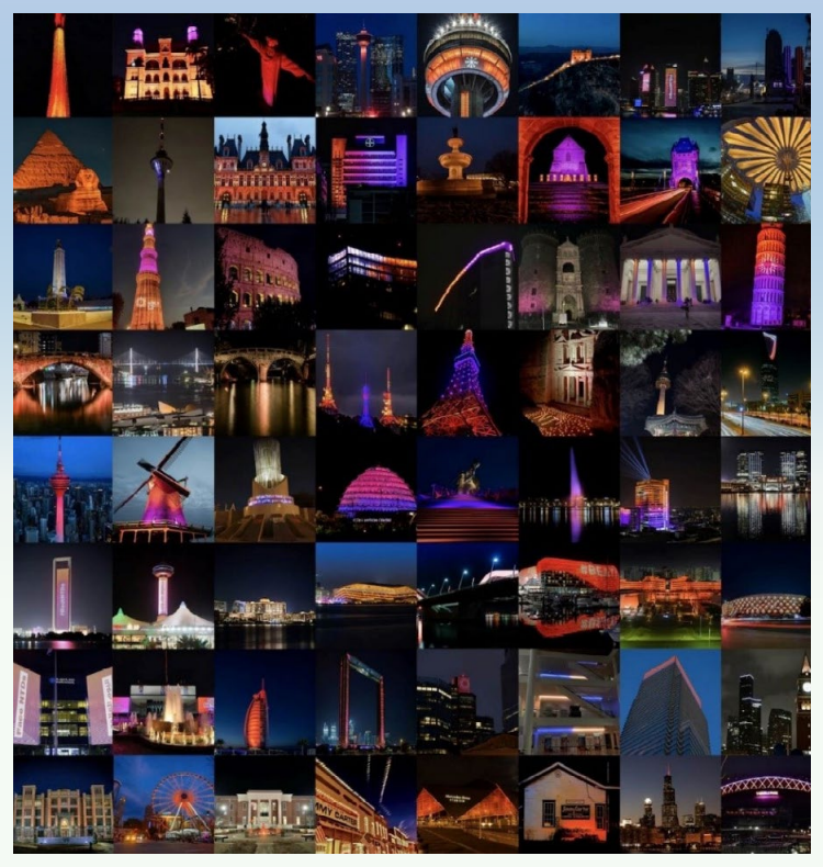
A photo showing landmark buildings that were lit up to mark the third annual World NTD day on January 30<sup>th</sup> 2022.

World NTD Day is a global movement that aims to galvanize the global health community and engage the public in the urgent effort to end NTDs. This year Uniting to Combat NTDs used World NTD Day to launch the 100% Committed movement, which exists to begin securing political and financial commitments in support of the Kigali Declaration on NTDs. The Kigali Declaration, a high-level political declaration, provides the opportunity to mobilize the political will, community commitment, resources and action needed to end unnecessary suffering from NTDs.