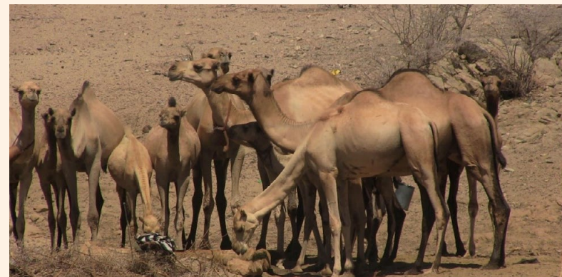
Dromedary camels drinking salty water from a water trough placed infront of a shallow well in Northern Kenya.

Dromedary camels (one-humped camels) are kept for milk, meat, hides, transport, and income. Additionally, they are a highly treasured commodity that are central to the community's cultural life and are becoming the preferred livestock due to their resilience to survive in harsh climates such as prolonged droughts. However, their productivity is being hampered by pests and diseases, resulting in huge agricultural losses.