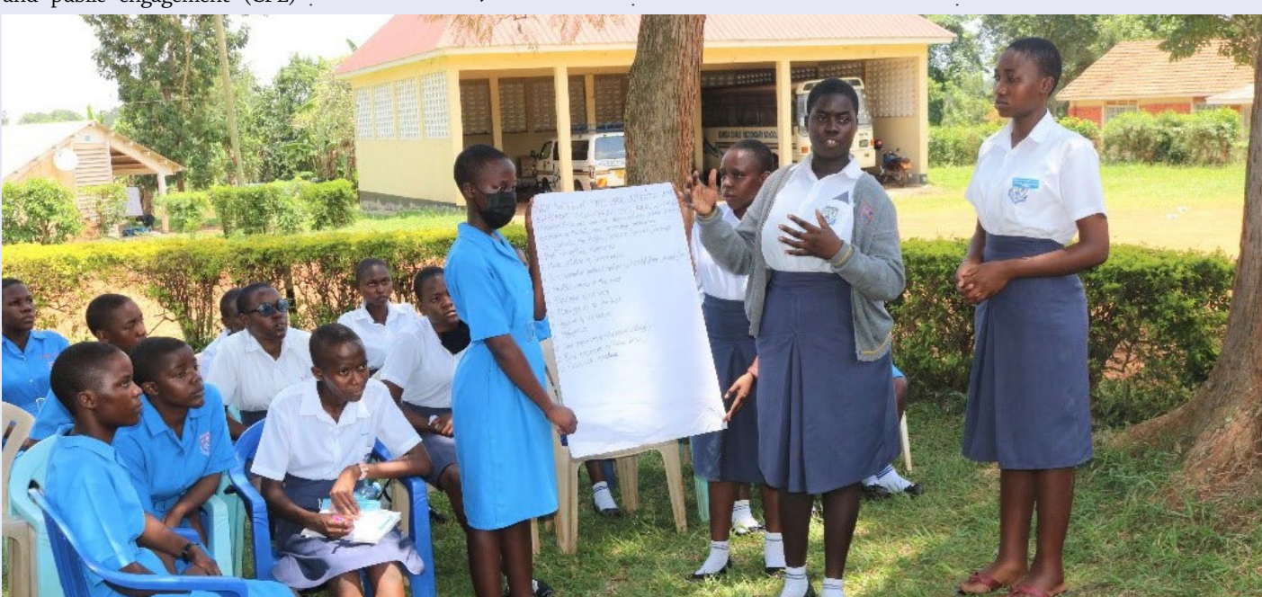
Some of the 'TB girls' make a poster presentation during a CPE session at their school

TB. After discussing TB at great length, we decided that the public needed to know about the dreaded monster killing masses. To achieve our goal, we agreed to use skits, poems, shirts, plays, animations and songs as a way of spreading awareness.