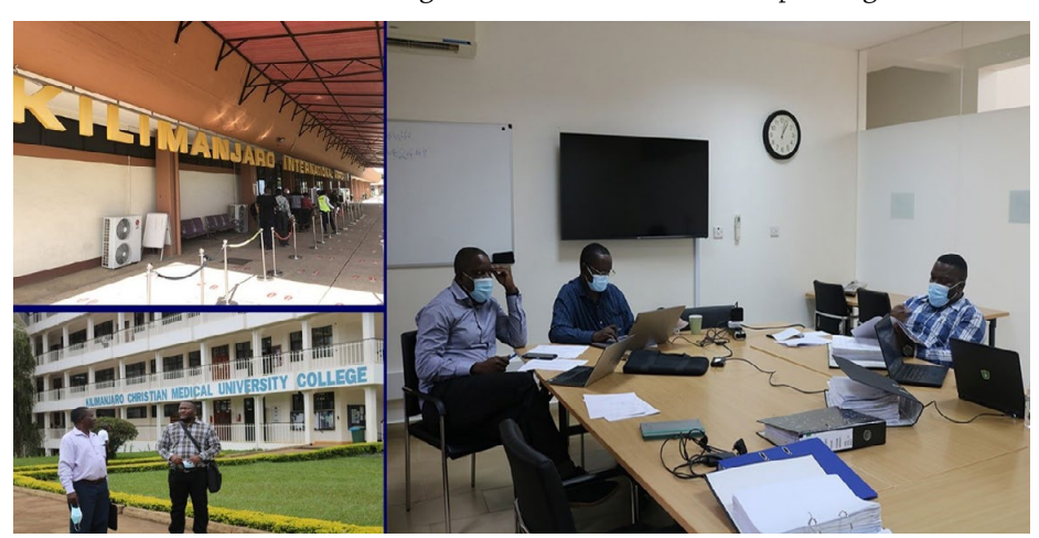
The THRiVE site visit team at partner institutions

The above-mentioned processes/practices have been followed up during the close-out