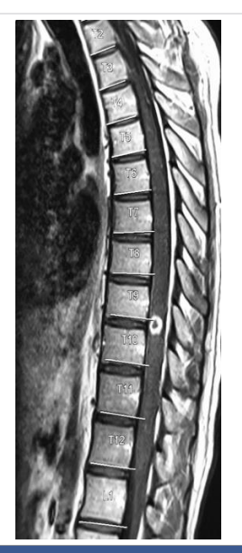
Figure 3: Spinal Magnetic Resonance imaging demonstrates a ring-enhancing lesion suggestive of spinal tuberculoma and increased signal intensity in thoracic vertebrae T3 to T6 and Gibbus on T2W.