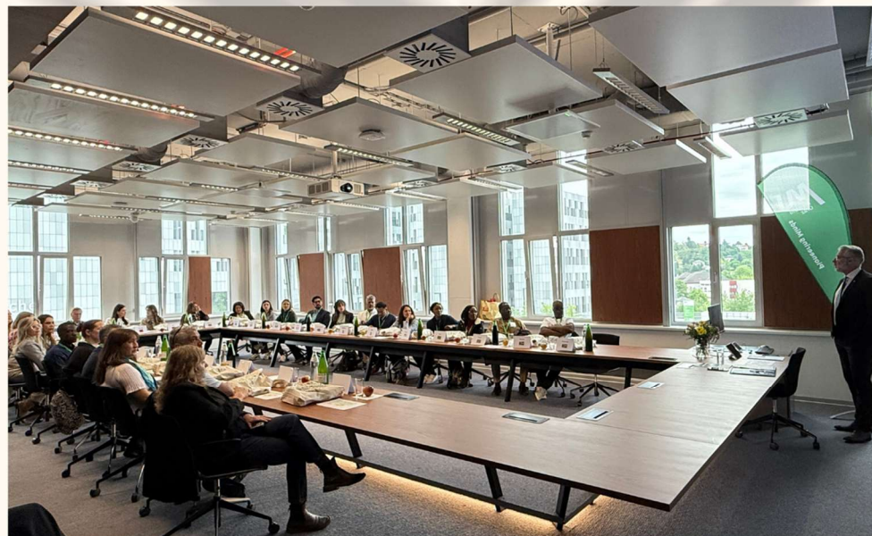
Vice Rector welcoming all participants