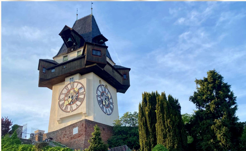
Clock Tower at Scholssberg