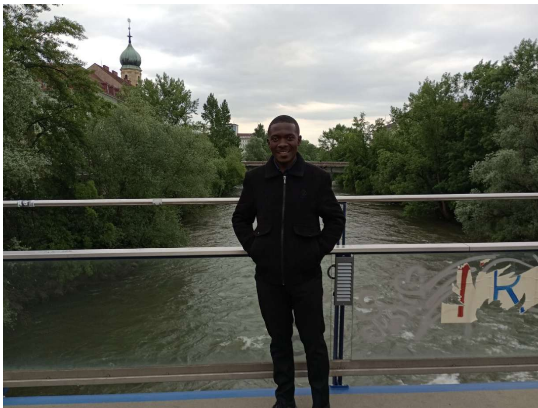
Figure 7 At River Mur in Graz