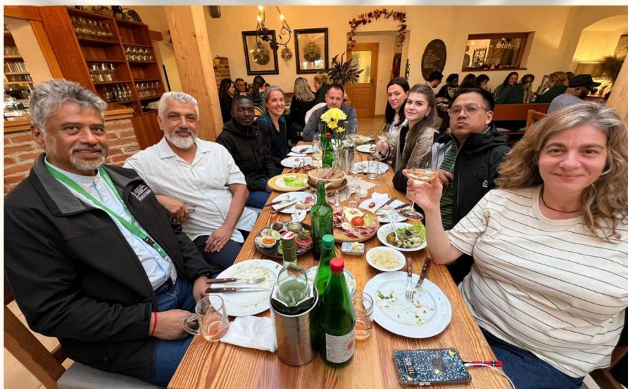
Dinner at Buschenschank