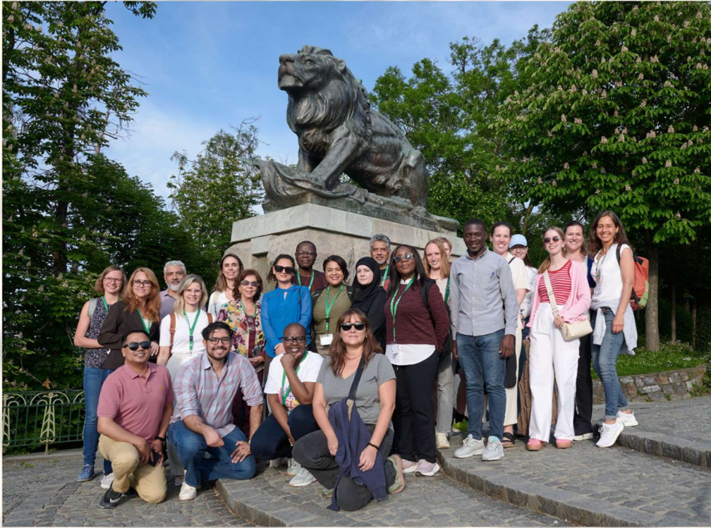
At schlossberg (Castle Mountain) Tour