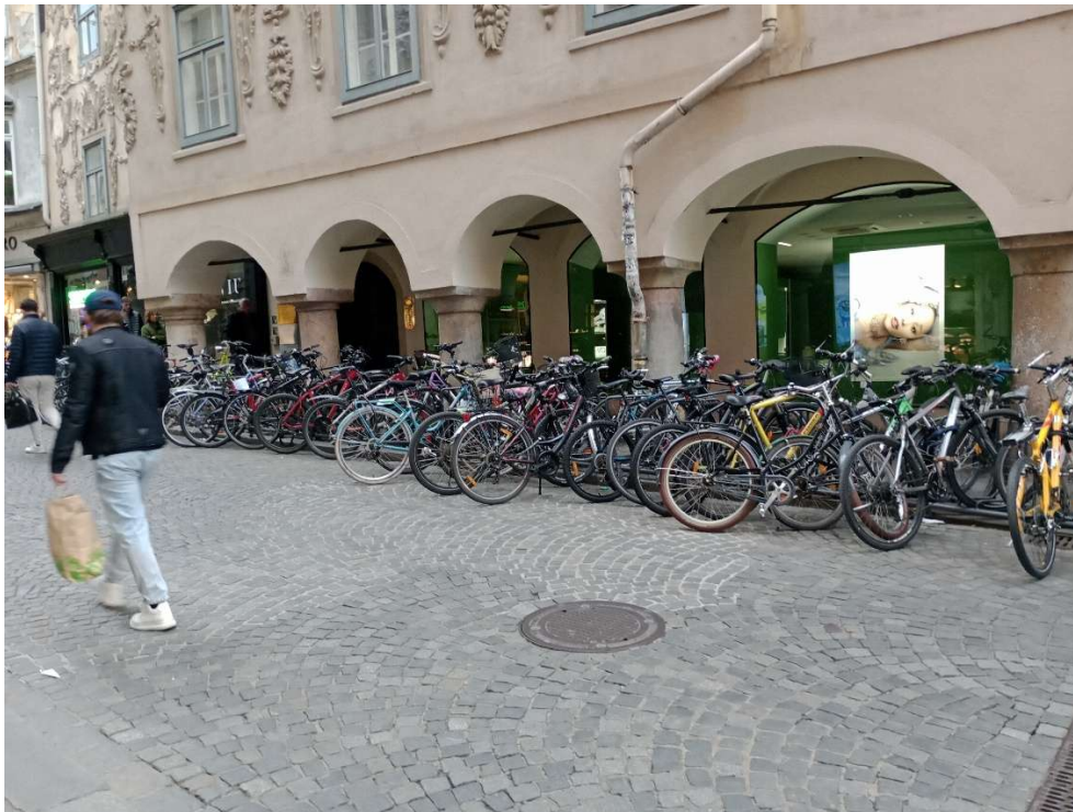
Figure 6 Bicycles at parks at the street in Graz