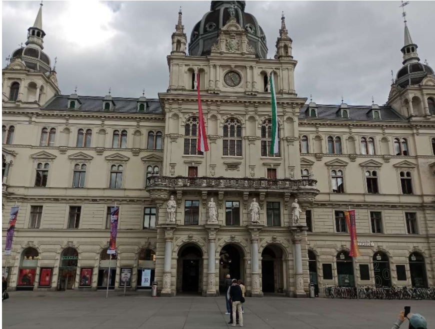
Figure 3 RatHaus, main city square